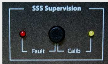
User interface on the front panel of the UT26 processor

Option SSS for processeur UT26 and StepArray column loudspeakers.